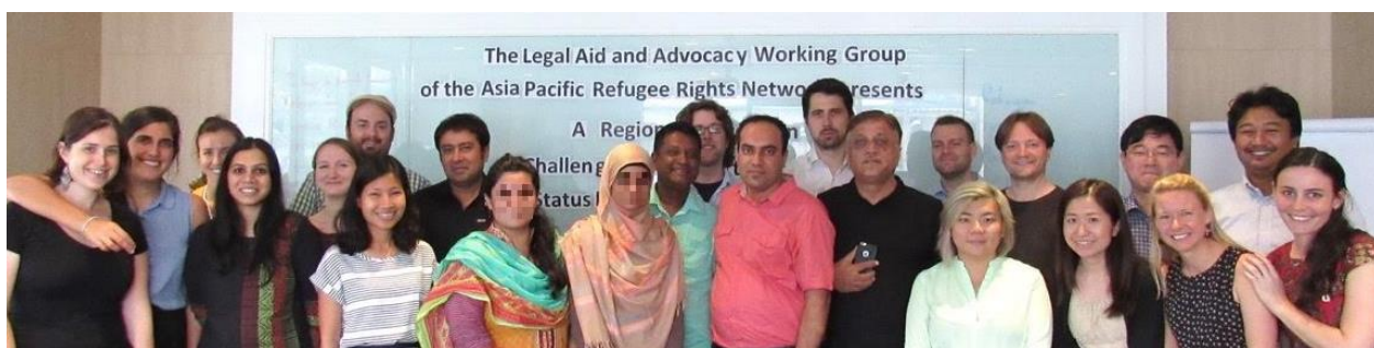
APRRN Legal Aid and Advocacy Working Group Retreat, Bangkok, Thailand, 25-26 April 2016

For further information, or to provide feedback, please contact: Brian Barbour ( barbour@refugee.or.jp )