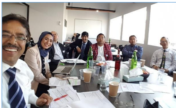
Photos: Indonesia hub (top left), Bangkok hub (top right) and Australia hub (left) workshops underway.