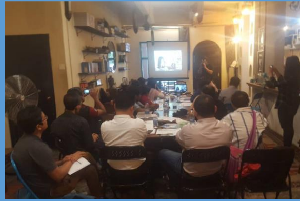
Photos: Feeding back next steps and ideas from Indonesia (left) and Malaysia (right) hubs.